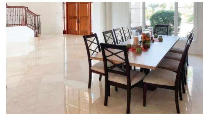
A recent residential cleaning job by Premier Janitorial SF